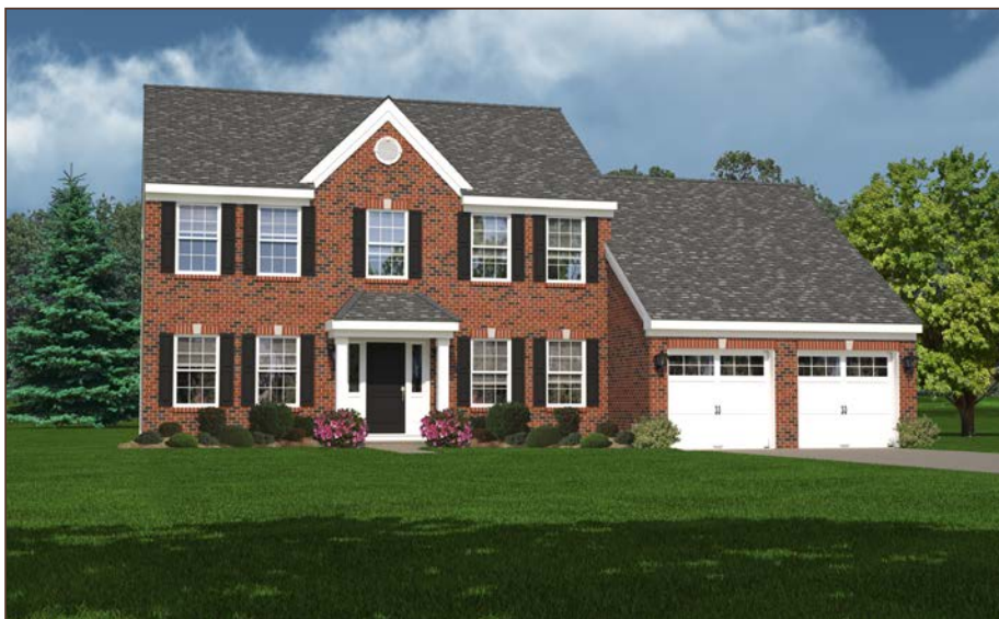
Elevation 4 (Brick)