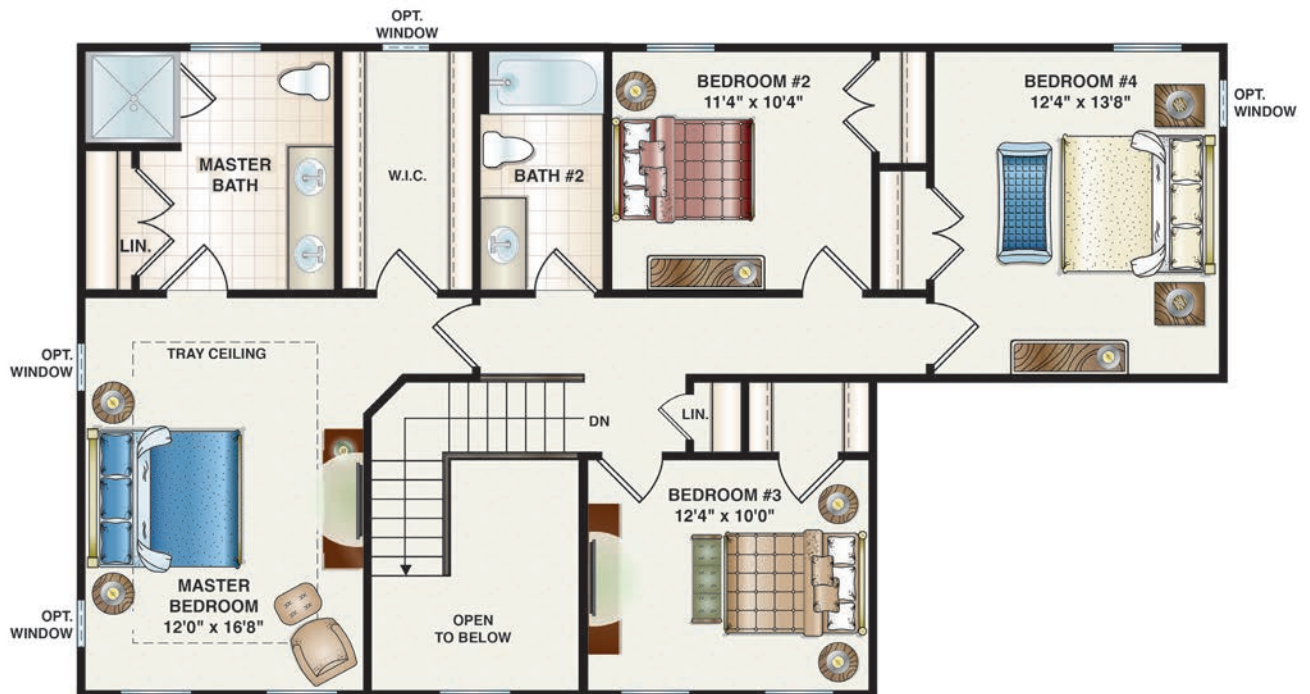
Second Floor— Elevation 1

All dimensions are approximate and subject to field variation. Some floor plan configurations may vary.