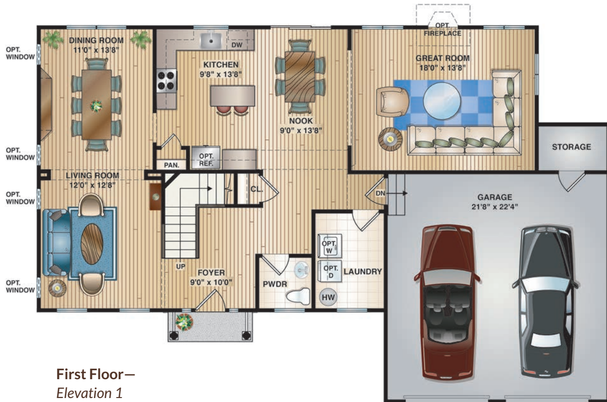
First Floor— Elevation 1

2,280 Sq. Ft. | 4 Bedroom | 2.5 Bath | 2-Car Garage